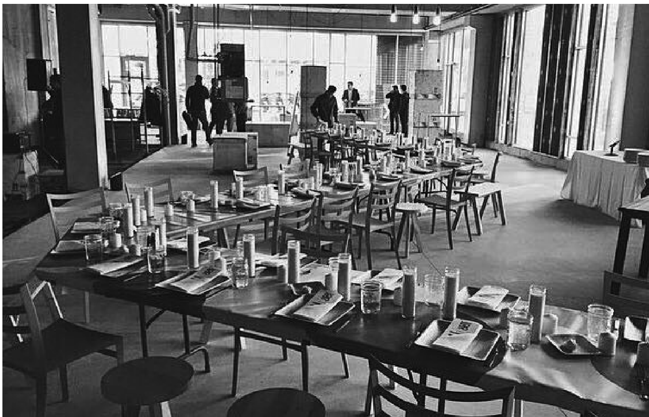
Figure 3: 50x50 Dinner and Design event curated by creative entrepreneur partner Ryan Tretow inside the North End Mobile Design Box.

MDB have launched two creative businesses, generated over $50,000 in direct fees and stimulated over $250,000 of economic development.