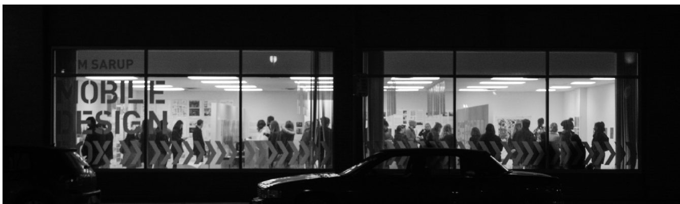
Figure 1: MDB on Gallery Night. Gallery night serves to launch every creative exhibitor in the space on a 4 month cycle.

Outside Milwaukee's downtown core are transitional 'middle landscapes', ones in which traditional neighborhood commercial corridors are struggling to redevelop not only a physical identity (filling in missing teeth) but also finding opportunities for additional economic investments. This context is juxtaposed between the tight knit urban fabric of downtown and the less dense residential urban landscapes found further from downtown.